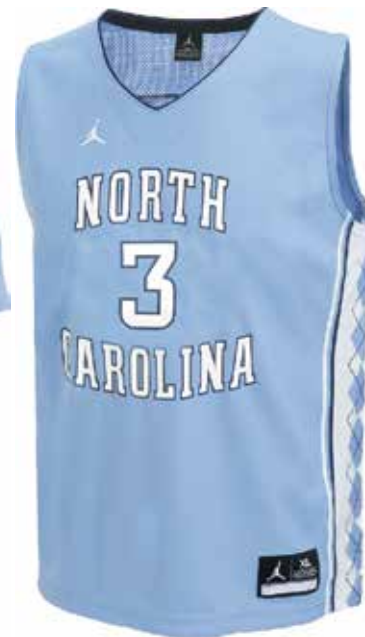
#90655 Youth #3 Replica '14-'15 Basketball Jersey