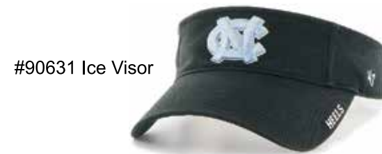
#90631 Ice Visor