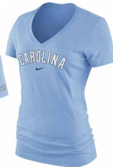
#90473 Nike Ladies' Arch V-Neck T