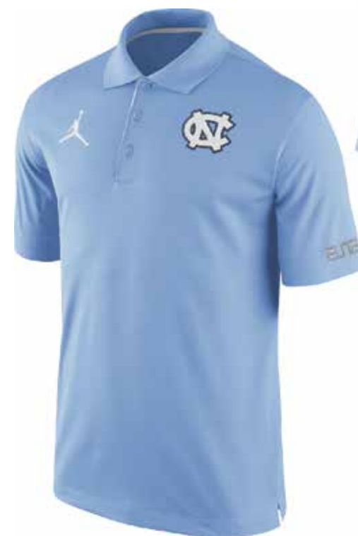
#90483 Nike ELITE Basketball Polo

THE OFFICIAL MERCHANDISE PROVIDER OF THE GENERAL ALUMNI ASSOCIATION SINCE 1996