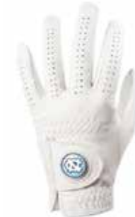
#64958 Golf Glove